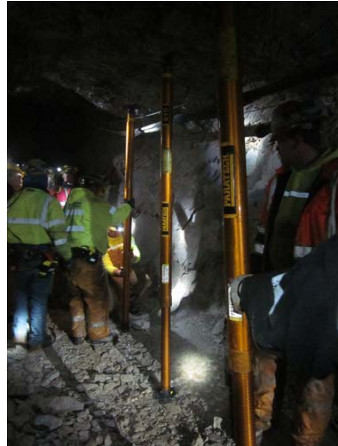
Placing struts in the testing area of the Sunshine Mine