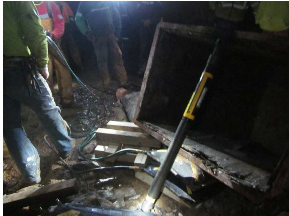
A rescue strut and heavy lift bags stabilizing an overturned ore cart