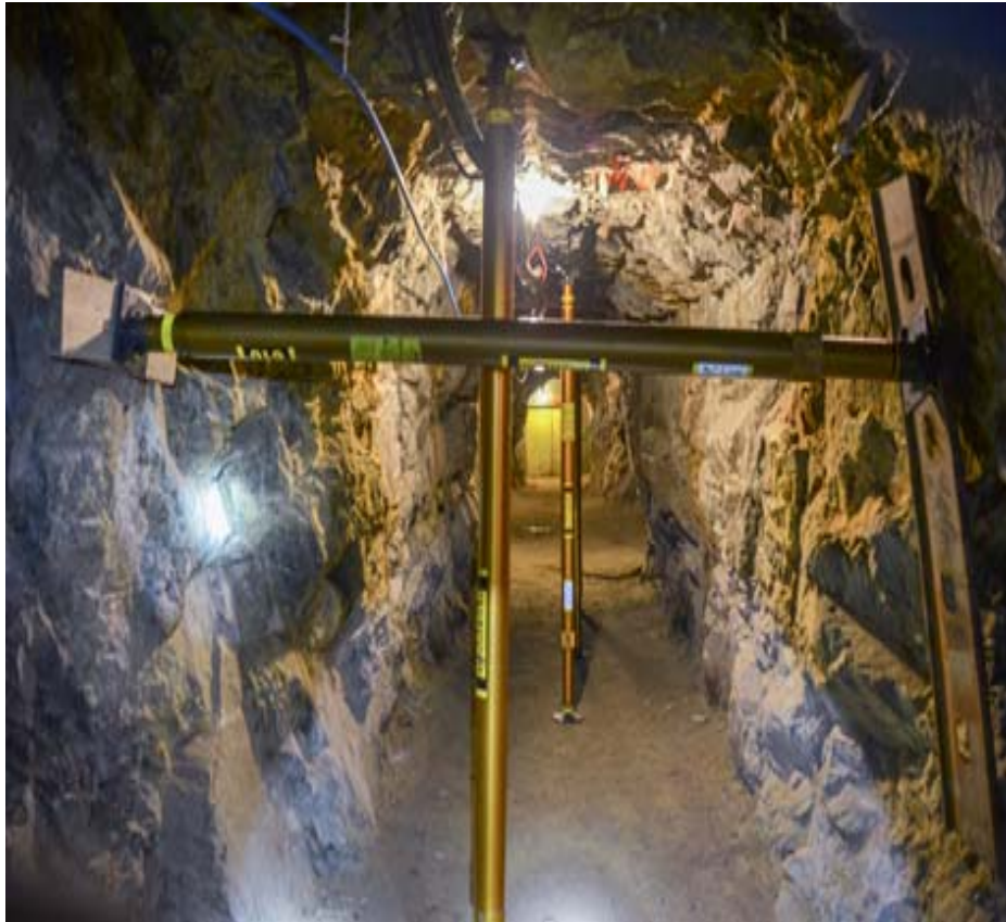
Full set up of the rescue strut system that shows both horizontal and vertical setups